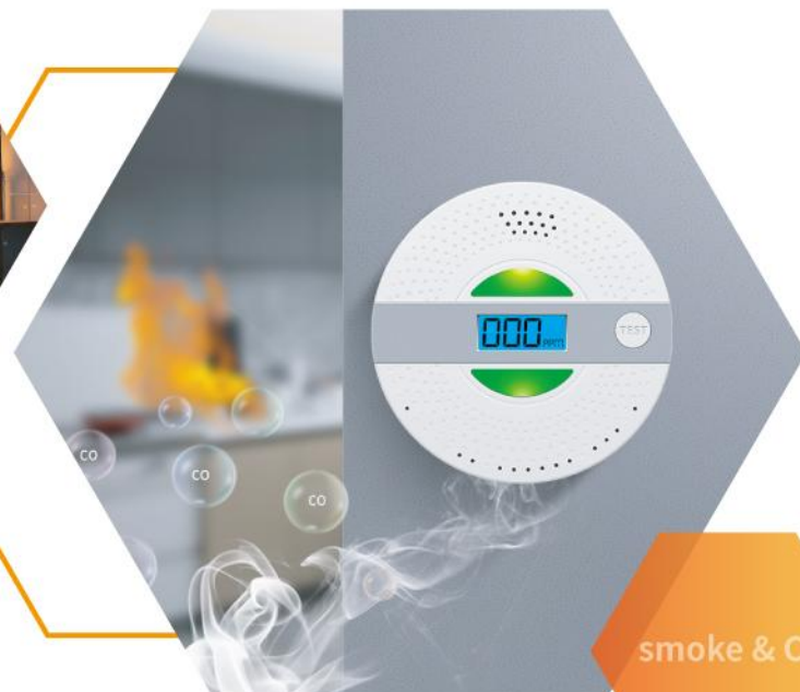
smoke & CO